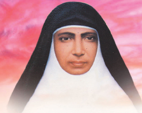
BLESSED MOTHER MARIAM THRESSIA